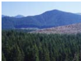
Using lower energy bulbs to reduce greenhouse gases