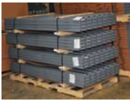
Reimbursing for pallets returned to CURRIES